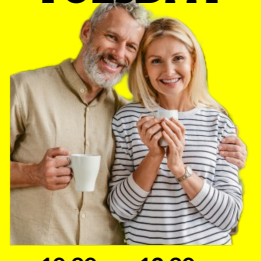
10:30am-12:30pm CONNECTIONS CAFÉ Coffee, cake & conversation. Puzzles and games.