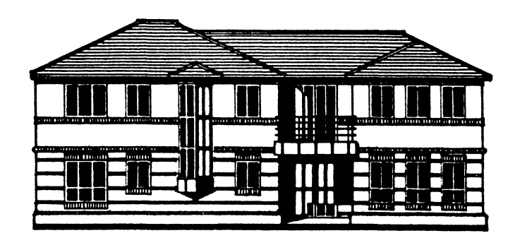
This elevation is reproduced from a drawing of the Architects, Conoley and Webb.

Anyone who can remember the stresses and strains of moving into a new house and furnishing it, can guess what the last few weeks of the building of 'The Greenwood Centre' in School Road have been like. It was the way rooms seemed to grow in size and then diminish and then grow again that was so extraordinary. One week the kitchen would seem big enough to launch a Tudor banquet; two weeks later there did not seem room to swing a skillet (let alone a cat) in it; then suddenly it contained two coolers and two sinks and a fridge and room for several people. The small office upstairs, intended for face-to-face counselling sessions seemed too small to take an easy chair at one time, yet rapidly expanded into a room with capacity for a small committee.