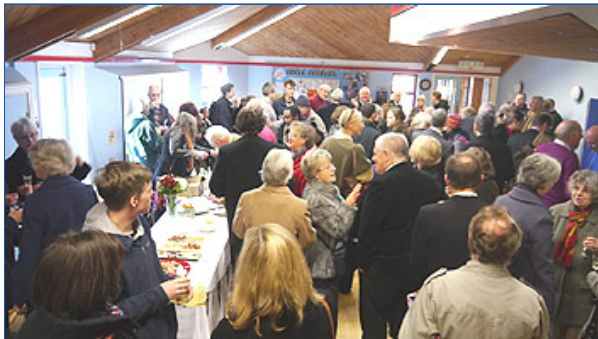
The reception in the hall