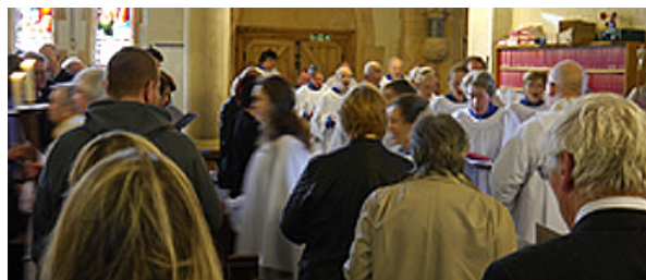
The choir processing through the church