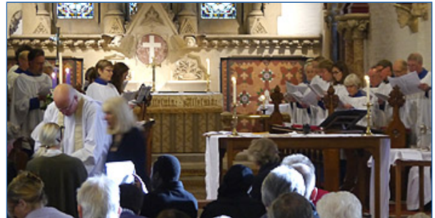
The choir singing