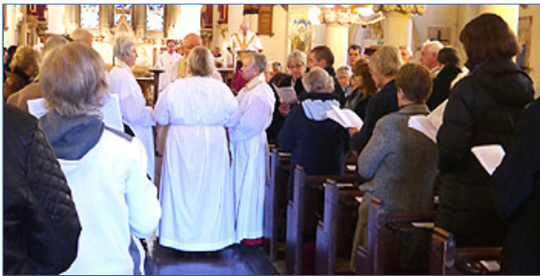
Reading the Gospel