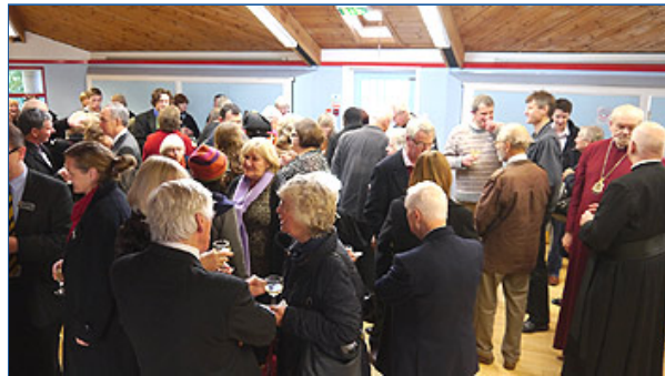
The reception in the hall