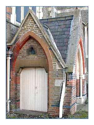
The west porch built in 1881