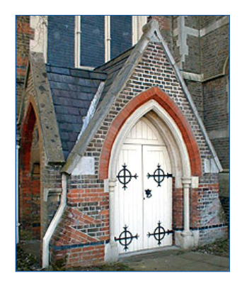
The west porch built in 1881