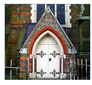
The original west porch

The northern aisle, together with an outer porch at the west entrance, was built in 1873. In 1881 a west porch, with a gable and stone cross, was erected after Revd Fitz Wyram's death in his memory, presumably replacing the origininal one. It replaced the old bell turret and the single service bell had to be rehoused at the same time. Between that time and around 2002 when the old west porch was taken down, an iron cross replaced the original stone one.