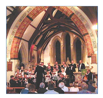
The Concert by The Apocalypse Singers and Orchestra