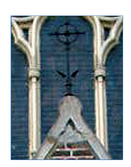
The west porch iron cross replaced the original stone cross