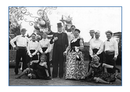
Old Peoples' Welfare Float 1971

There were three particular groups in existence in the 1970s in the parish, which helped people in different ways to come to a deeper understanding of their faith: the Catechumenate, Good News Group and Koinonia.