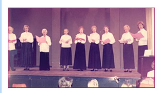
The Ladies Choir in 1977

The Ladies Choir, started in the 1960s as a Mothers' Union Choir, was open to anyone who loved to sing, 'had a go' at all kinds of music and enjoyed every moment of it. "We really do not claim to be very good, but we do have a great deal of fun." They used a great deal of music, two and three parts, all written for ladies voices. Some songs were very familiar but some were less well known and more challenging and although singing was the main object, fellowship was equally important. The choir entertained folk at the Old Peoples' homes in the area, at the blind club in Twickenham, Hampton Court House and various churches and at Christmas they ran a 'Carol Sing-a-long' afternoon with mince pies, sherry and a cup of tea. It closed in 2011 due to the fact that most of its members were over eighty!