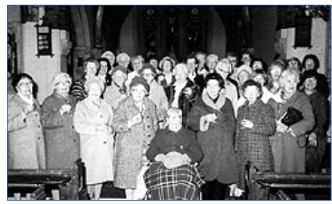
The Mothers' Union 75th anniversary in 1972 and 100th anniversary in 1990

of Penzance'. In total, over 100 people, young, old, single and couples, have been to these outings. Whilst the theatre itself gives great pleasure, St James's Theatre Club is about other things too. It can bring people into contact with one another for the first time: "I hadn't realised she was so interesting", said one about another! It also allows people to go out during the evening in a safe environment when they may not otherwise have done so: "It's ages since I've been to the theatre but it's so nice to have the company of so many friendly people." And it also allows people to help others: "I'd drive to Richmond anyway, so it's no trouble for me to pick you up and drop you off at the end of the evening."