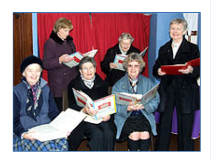
The Ladies Choir in 2005