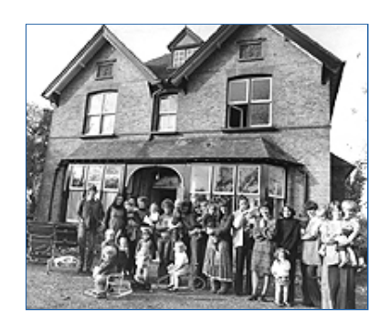
Young Wives Group 1960s

Hearing that prayer groups could be one way of strengthening parish life, six parishioners started meeting regularly in 1950, praying together for the parish, for people known to be sick, and for other parishes, people and