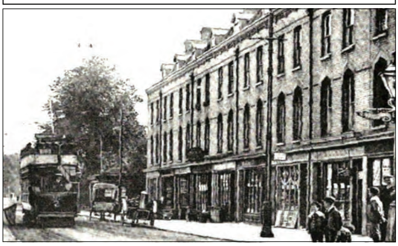
Hampton Hill High Street, looking south, 1903