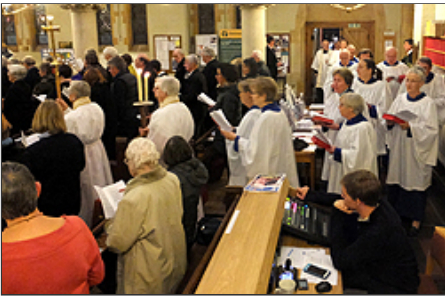
Entering the Church to the procesional hymn, ' O Lord, my God, when I in awesome wonder'