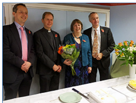
The Winterburns with the churchwardens