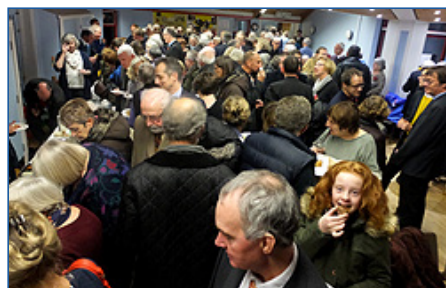
Refreshments in the hall