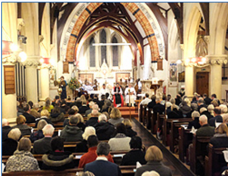
The Liturgy of the Word