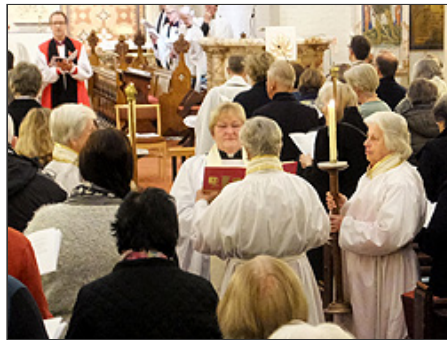
The Gospel Reading