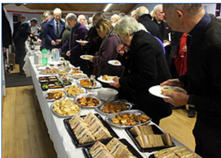
Refreshments in the hall

See these photos larger and many more on the photo album The Institution & Induction of the Revd Derek Winterburn .