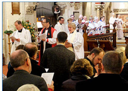
The last hymn