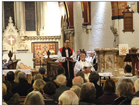
The Bishop welcomed the congregation and introduced the service