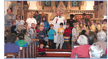
An activity at an early informal service