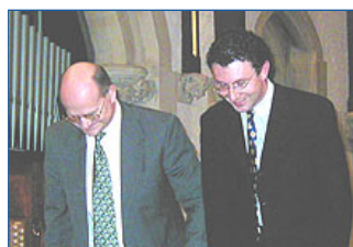
After the Recital