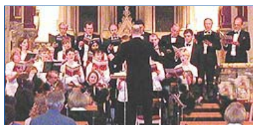
The Apocalypse Singers