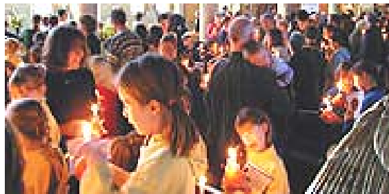
Scenes from a previous Christingle service at St James'

The Christingle services provide vital funds to support today's vulnerable children. Thanks to the continued participation of churches around the country, and the generosity of many people, The Children's Society is in a stronger position than ever to continue its work for children. Your support on 3 December is vital.